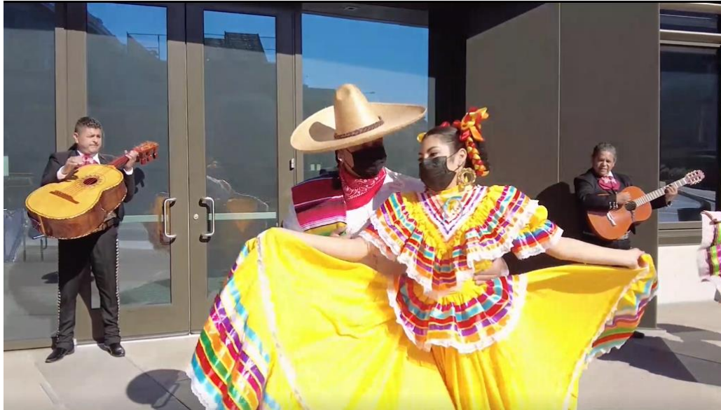
Ballet Folklórico Netzahualcoyotl dancers perform accompanied by Mariachi Monumental in 2021