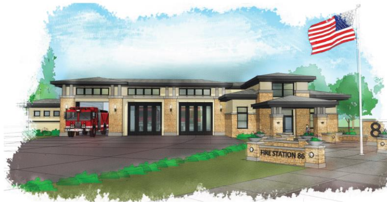
PERSPECTIVE SKETCH - ENTRY

Following the January contract award, the project team held a kick off meeting. After the final utility placements, the project is anticipated to begin in March. The groundbreaking ceremony is scheduled for April 9, 2021, at 2 p.m.