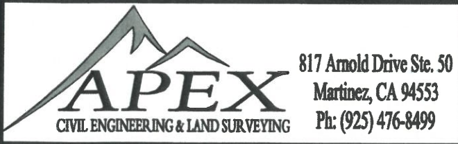
EXHIBIT 'B' PLAT TO ACCOMPANY LEGAL DESCRIPTION

DRAWN BY: BJL PROJECT NO: 16119 SCALE: 1"=100'