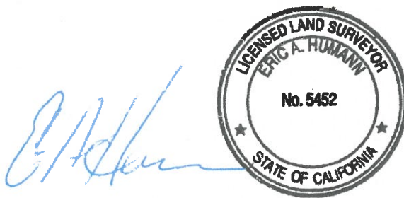
Exhibit B attached hereto and by this reference made part thereof.

Containing 334,645 sq. ft. more or less.