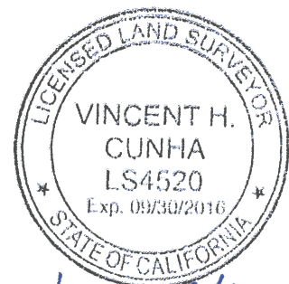
EXHIBIT B, A PLAT IS ATTACHED HERETO AND MADE A PART HEREOF.

CONTAINING 2,432 SQUARE FEET, MORE OR LESS.