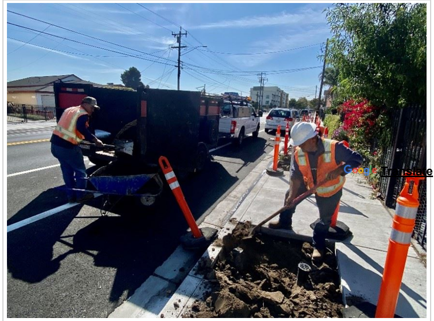
2. Workers unloading tools and digging tree wells the western side of FJW.