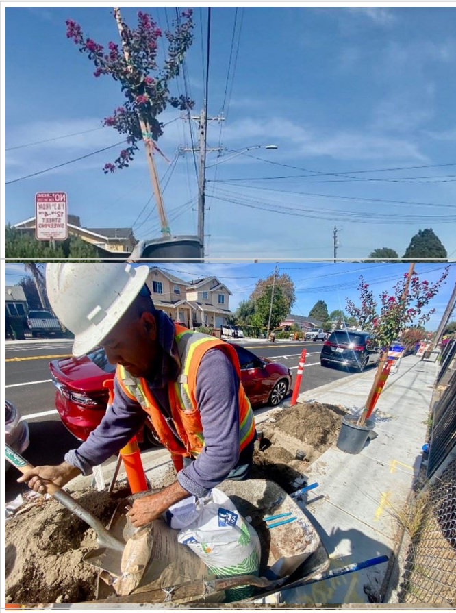
5. Adding compost and fertilizer to the soil mix as the trees are planted.