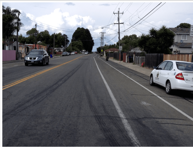
7. Photo of Fred Jackson Way (FJW), south of Wildcat Creek, taken before the project began in 2020.