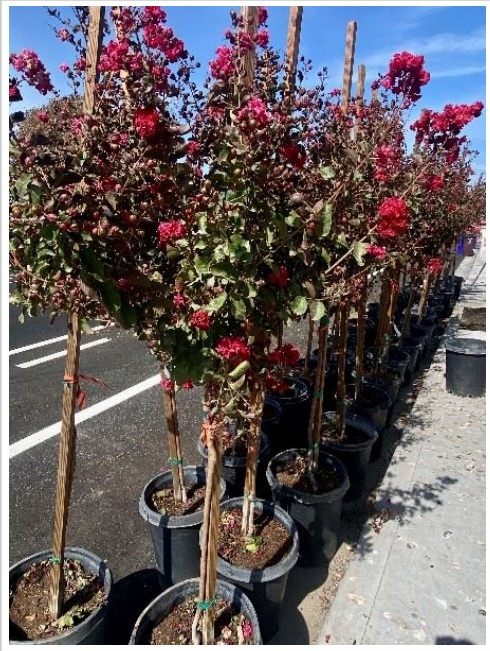
1. Crepe myrtle trees waiting to be planted on FJW.

The County would like to acknowledge the State Coastal Conservancy for the grant funding under Prop 1 that made this project possible. (see the NRWC Project Description for details).