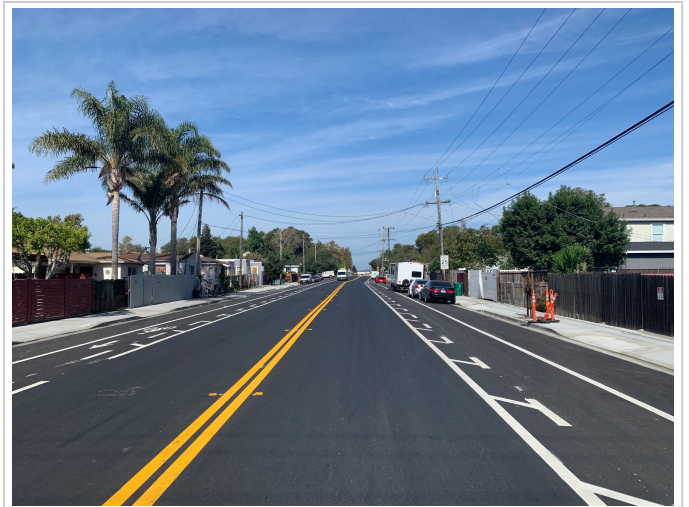
8. Photo of FJW in about the same location, following completion of the 1 st Mile/Last mile and urban greening features