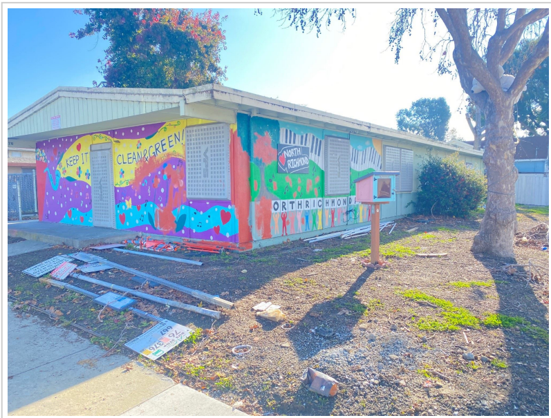
Mural on building at Market St & Fred Jackson Way

The Fred Jackson Way (FJW) 1st Mile/Last Mile Project , otherwise known as a "complete street" project, was designed to improve bicycle and pedestrian access along FJW. This project was led by the County Public Works Department's Transportation Engineering Division. By January 2022, new, widened sidewalks on both sides of this street had been largely completed, while striping occurred in summer 2022. The last step to install the urban greening component occurred in late October 2022. The urban greening component of it consisted of adding street trees on several sidewalk portions of this new complete street. Both elements of this subproject of the NRWC have been completed as of November 2022, following almost 2 years of construction.