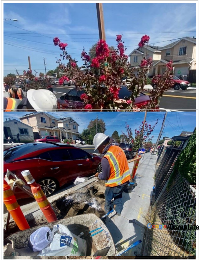
6. Looking north on FJW as a worker spreads fertilizer on a freshly planted tree.