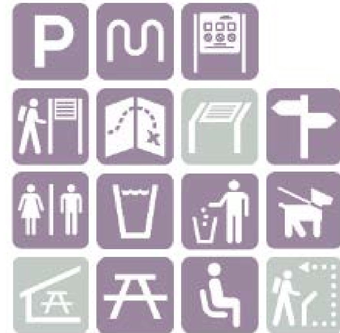
Recommended Amenities at Staging Areas