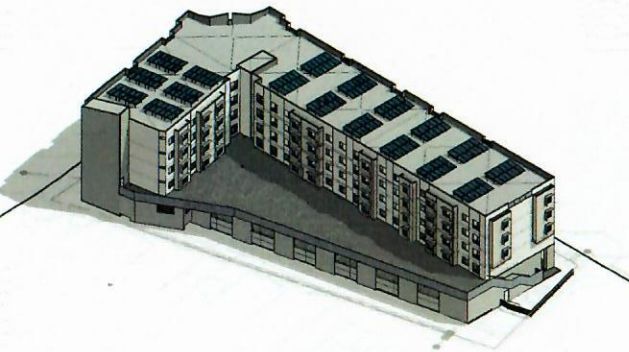
AERIAL - COURTYARD ①