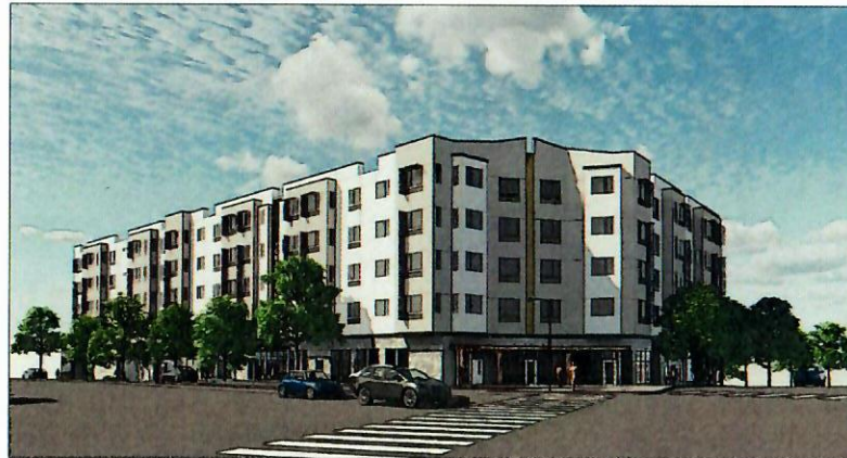
PRELIMINARY PERSPECTIVE LOOKING WEST FROM INTERSECTION