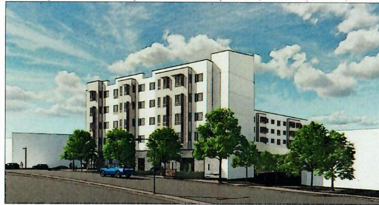
PRELIMINARY PERSPECTIVE LOOKING SOUTHEAST ALONG YGNACIO VALLEY ROAD