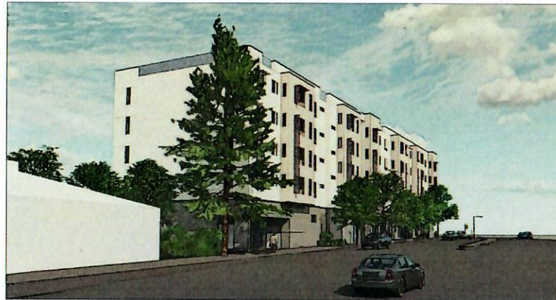
PRELIMINARY PERSPECTIVE LOOKING NORTH ALONG CIVIC DRIVE