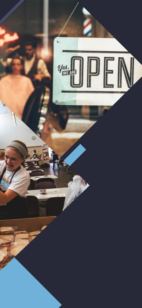
FY22/23 CDBG Request & Recommendation Table Economic Development Category