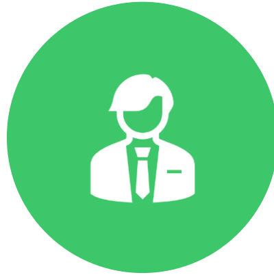
HOMELESS WORKFORCE INTEGRATION NETWORK (H-WIN)