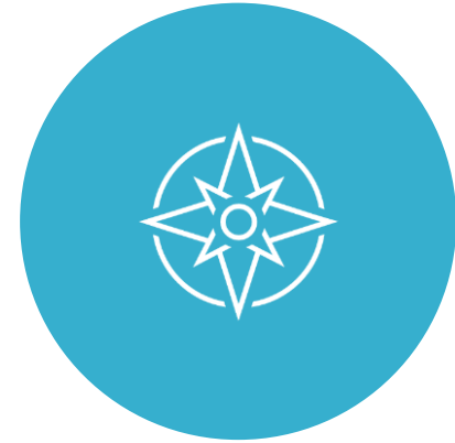
SYSTEM PARTNER MAP