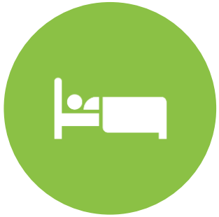
PROJECT ROOM KEY