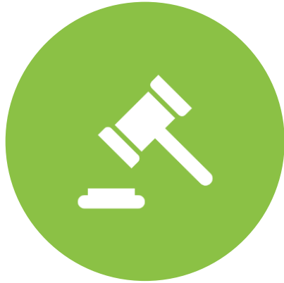
HOLISTIC INTERVENTION PARTNERSHIP (HIP)