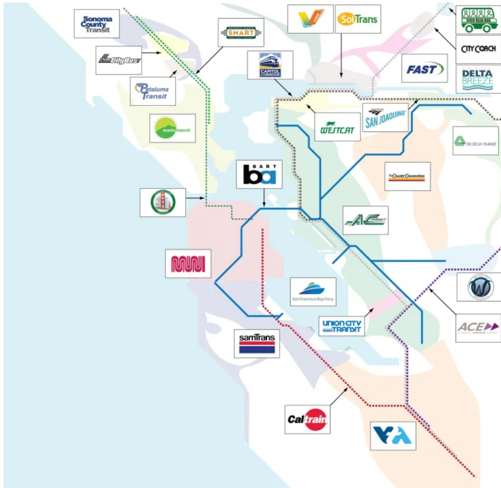
The Bay Area's 27 transit agencies.

By DANIEL BORENSTEIN | dborenstein@bayareanewsgroup.com | Bay Area News Group