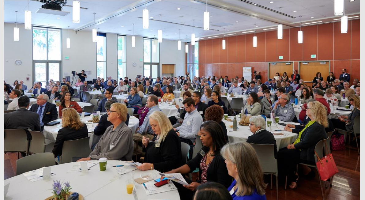
A full house of stakeholders attended the May 2019 Northern Waterfront forum at the Antioch Community Center.