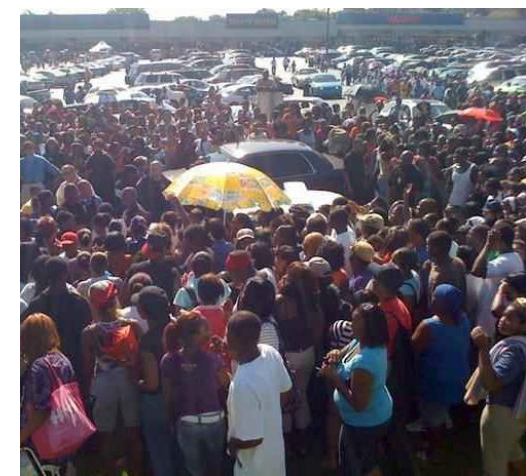
LONG LINES AND CHAOS SECTION 8 HOUSING, PORTSMOUTH