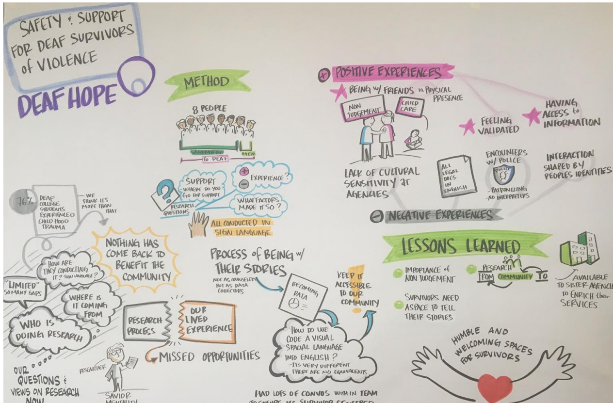
Community Based Participatory Research - Survivor Centered Advocacy