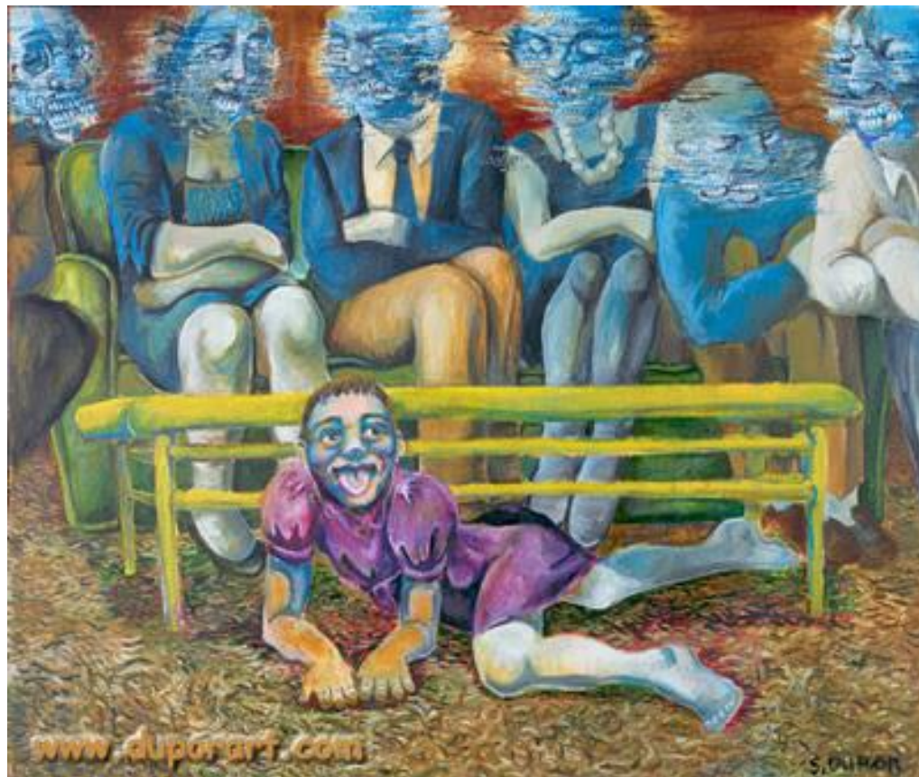
“The Family Dog” Dupor