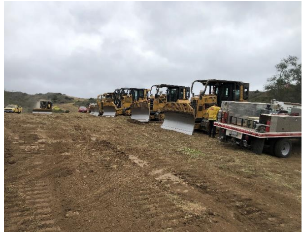
Con Fire Dozer 220 training at Camp Pendleton with eight other agencies from Sacramento to San Bernardino County.