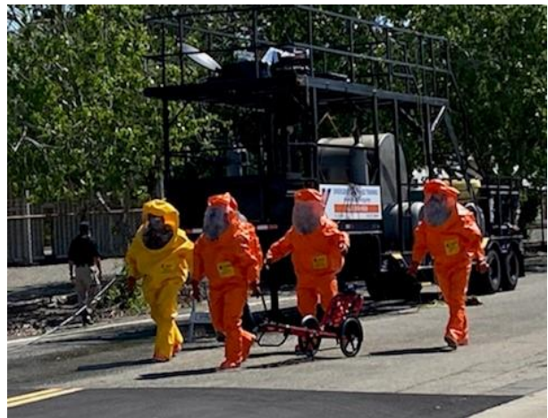
Con Fire hazardous materials team at the recent SENTINEL Response drill at the former Concord Naval Weapons Station. Our team worked alongside Alameda County Fire, Berkeley Fire, and Oakland Fire Department hazardous materials teams in simulated responses to complex hazardous materials and rescue problems.