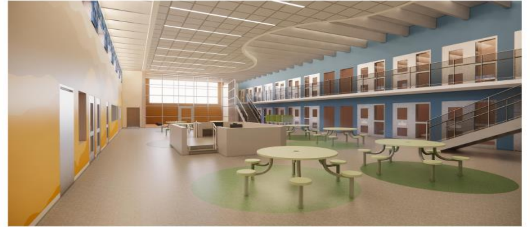
DAY ROOM TO RECREATION AREA