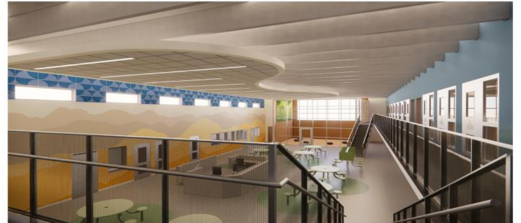
MEZZANINE TO RECREATION ROOM