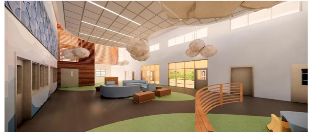
VISITATION - VIEW 3