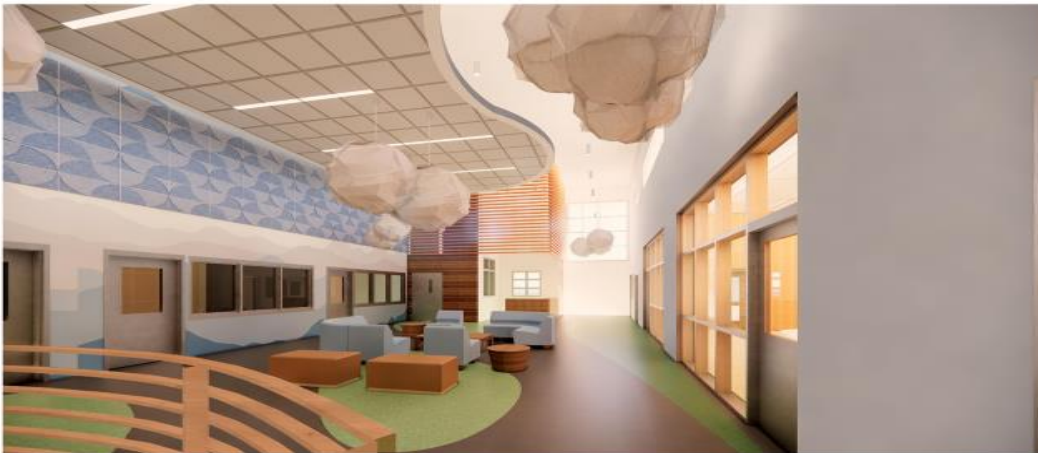
VISITATION - VIEW 2

WEST COUNTY RE-ENTRY, TREATMENT AND HOUSING