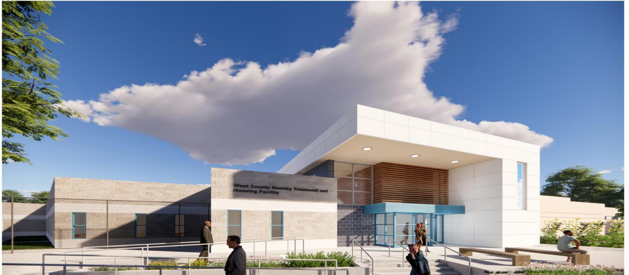
VIEW AT ENTRANCE LOBBY & VISITATION

WEST COUNTY RE-ENTRY, TREATMENT AND HOUSING