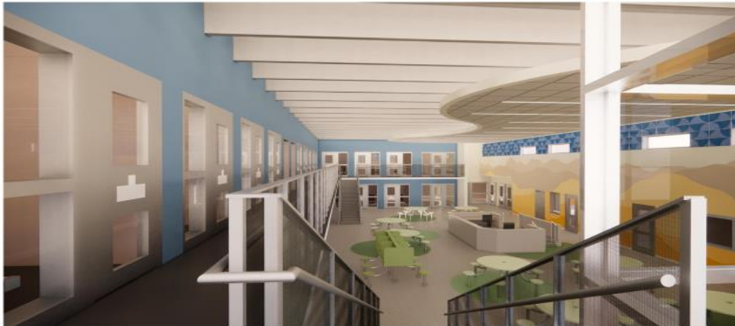
MEZZANINE FROM RECREATION AREA