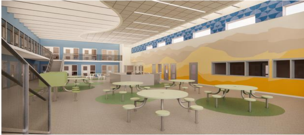
DAY ROOM FROM RECREATION AREA