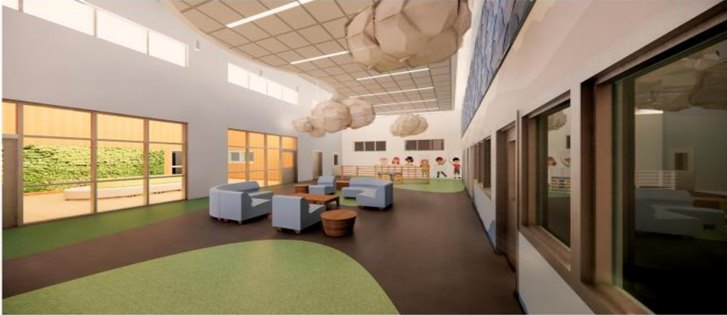
VISITATION - VIEW 1