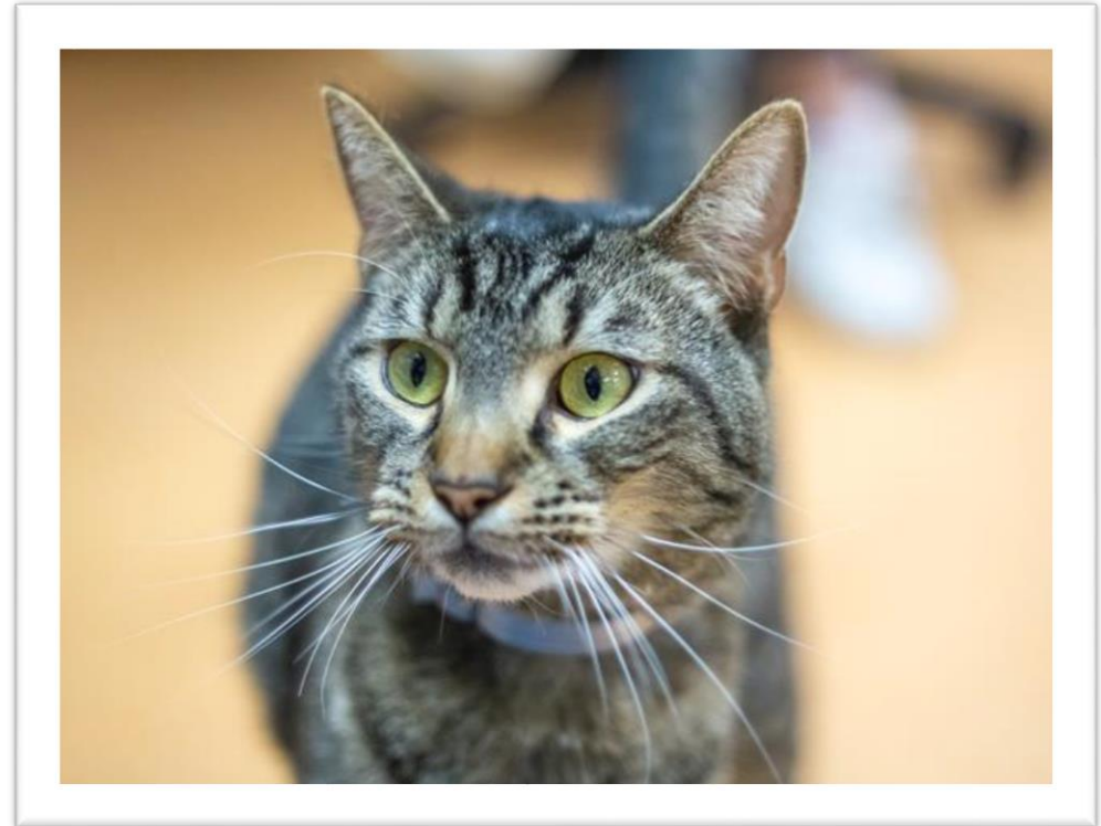
Hiccup's looking good after getting the care he needed.

Hiccup was pulled by CCAS rescue partner, Super Furiends, who continued Hiccup's care and adopted him into his forever home!