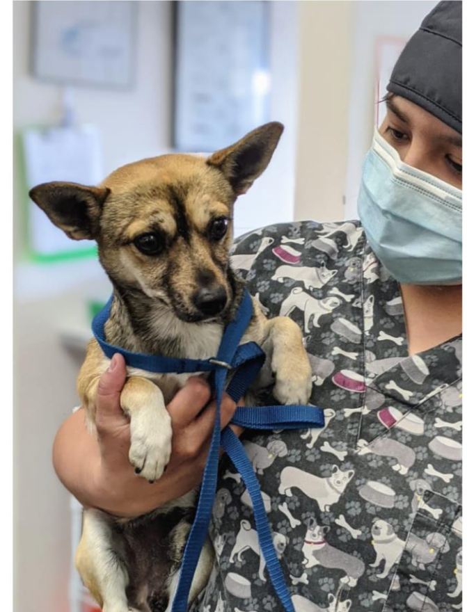
Jack the cat and Bendy the dog, two recipients of Fix Our Ferals' assistance program.