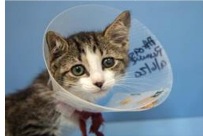
Daisy then and now

The owner reluctantly submitted a surrender request to the CCAS Pet Retention Program, as she was unable to pay for the procedure at her own vet. Through our Pet Retention Program, and in partnership with the East Bay SPCA’s Humane Advocacy Program, Daisy was able to receive the surgery she needed and remains happily in her home with her family.