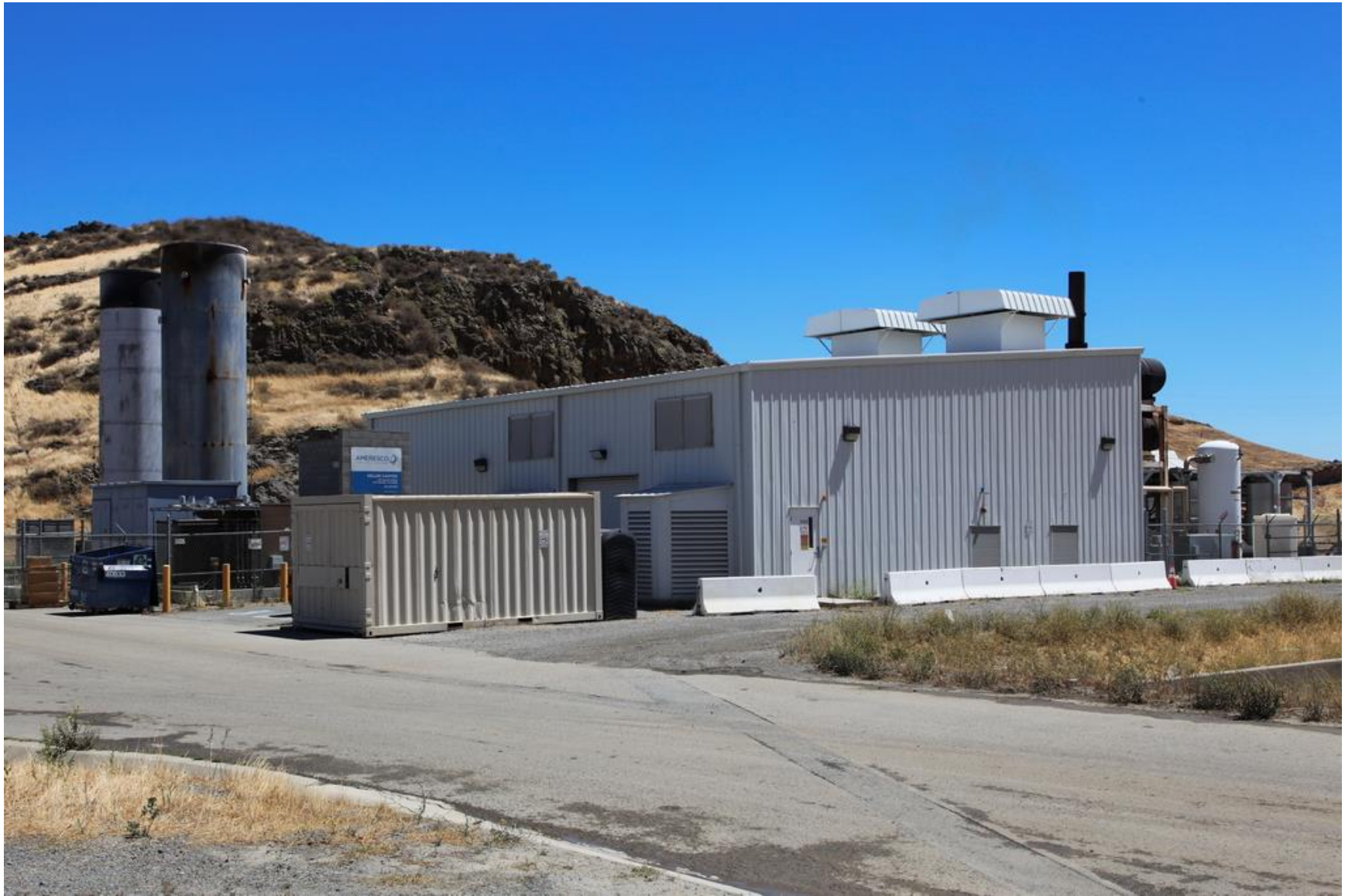
Existing Ameresco LFG Power Plant Looking Northeast