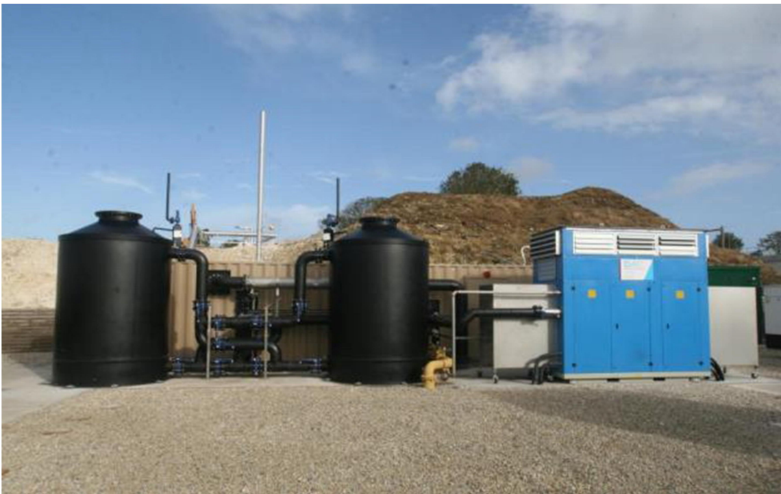
Carbon Tanks (typical)