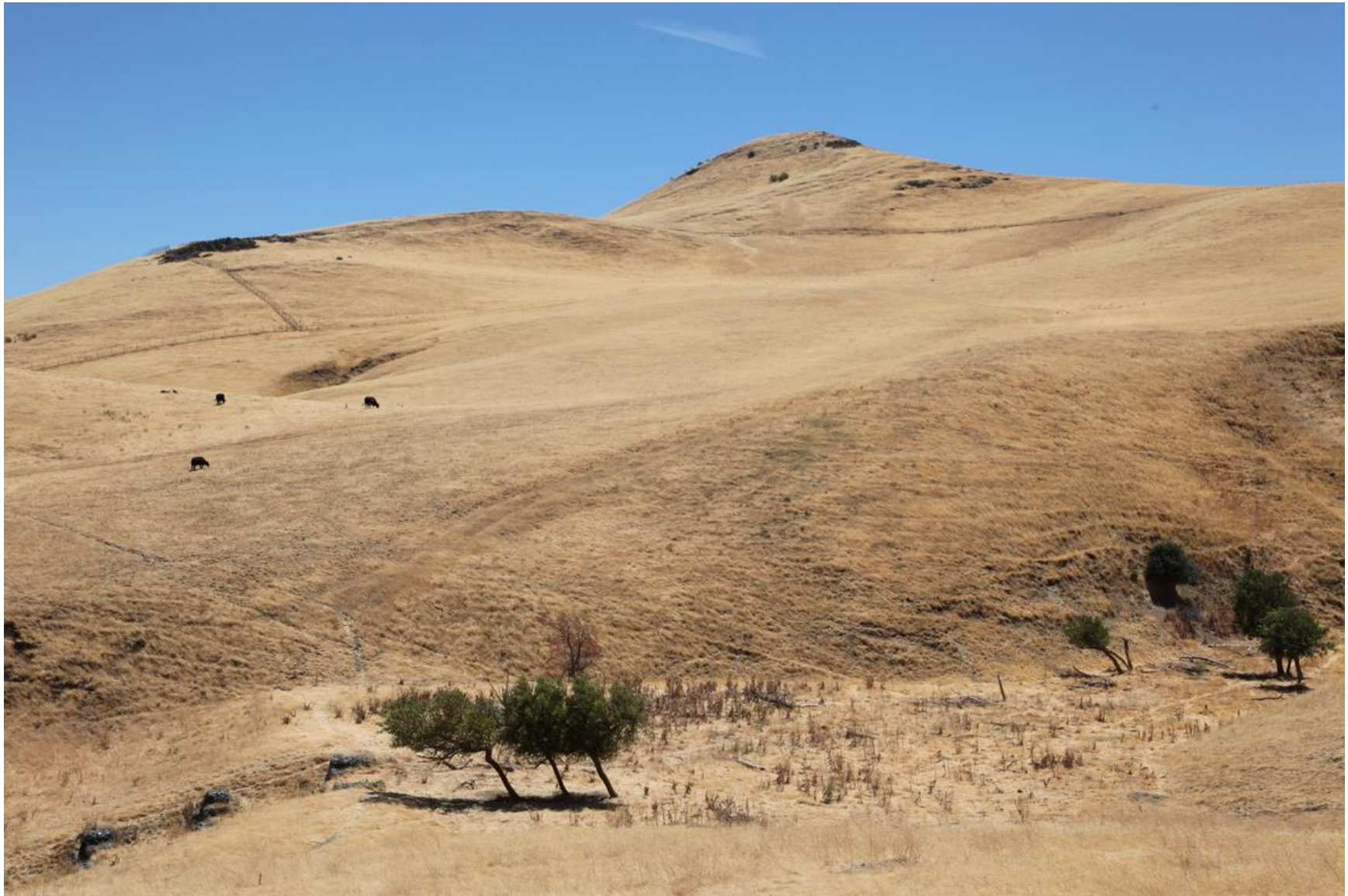
Keller Canyon Special Buffer Area Looking East Source: Ameresco, April 2020