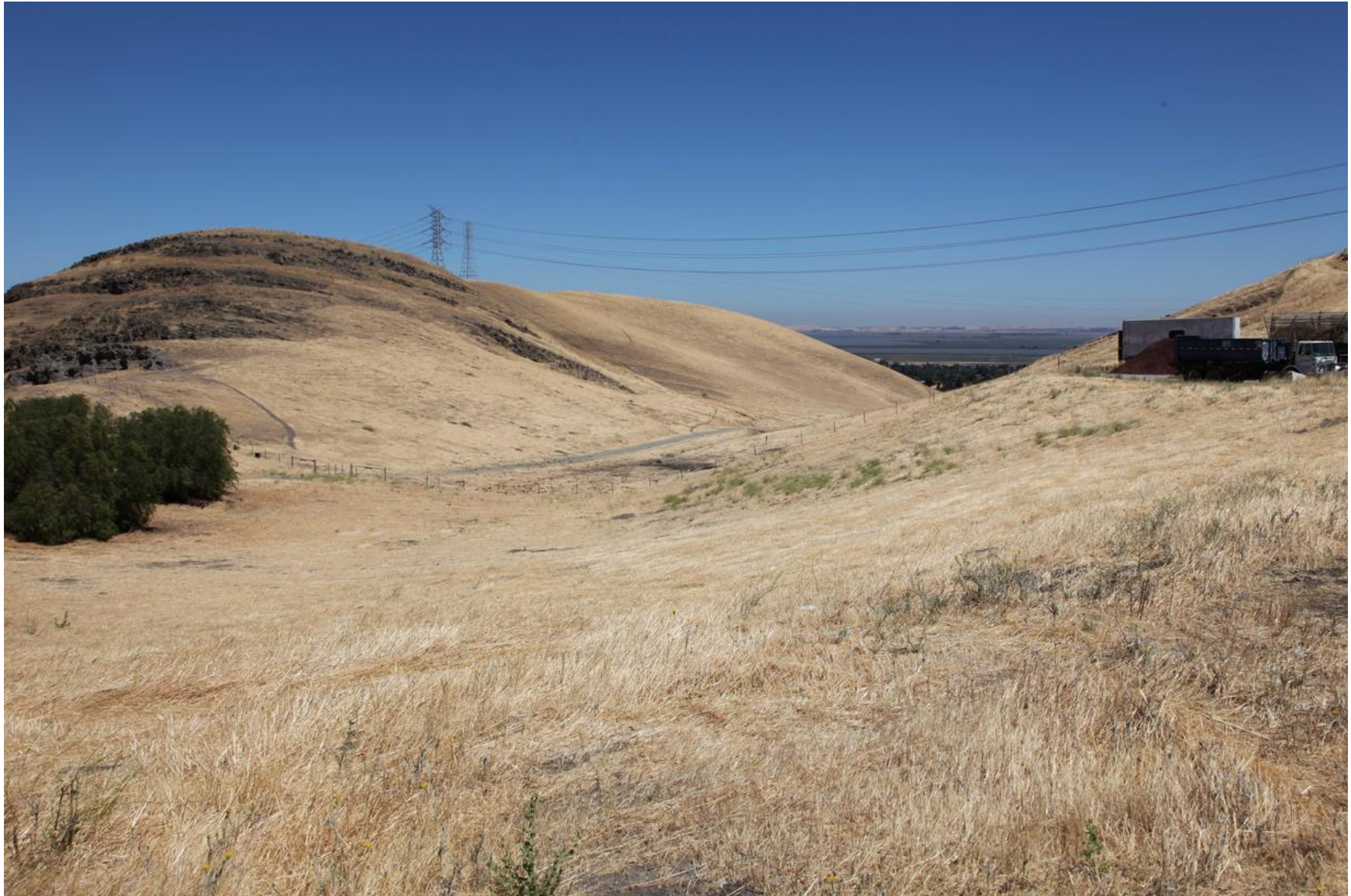
Site of Proposed RNG Processing Facility Looking Northwest