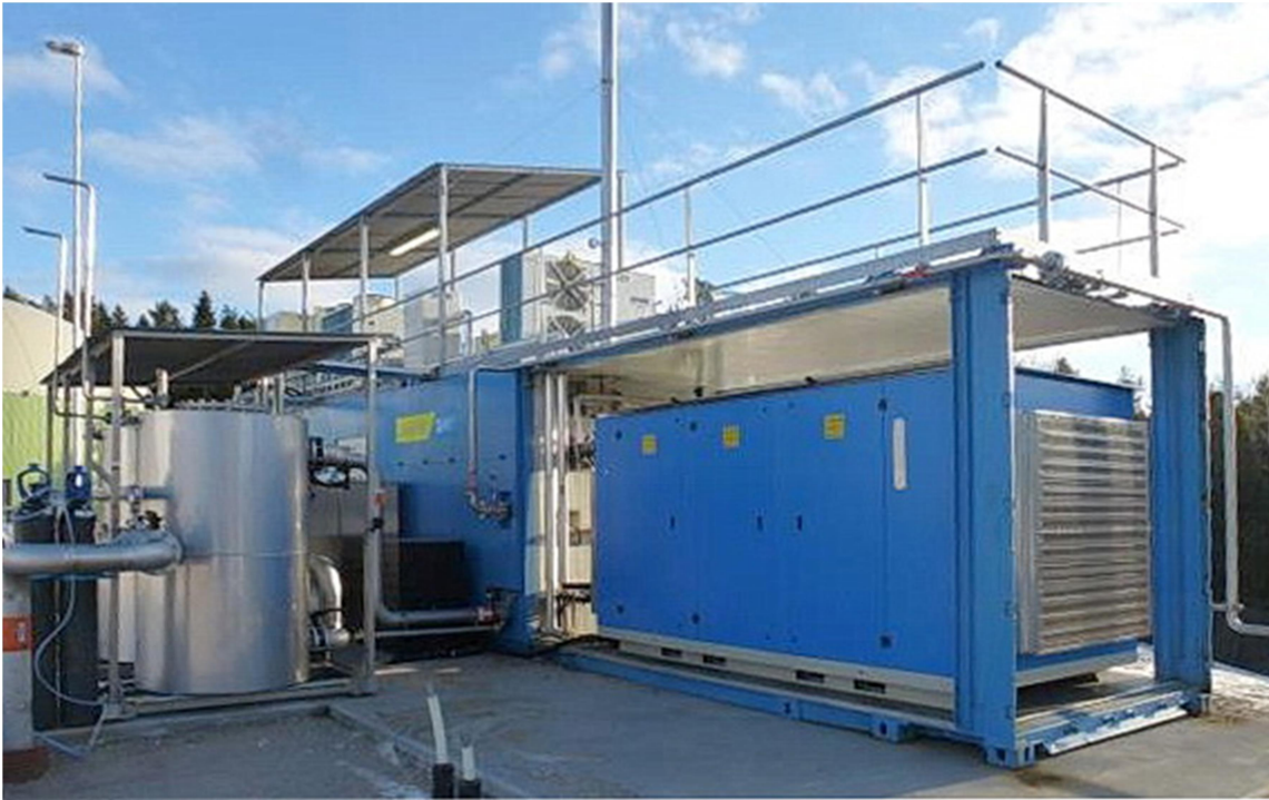
Containerized Membrane (typical)