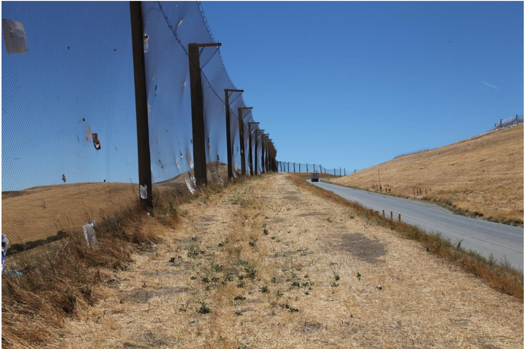
RNG Transmission Pipeline Along Litter Fence Looking East