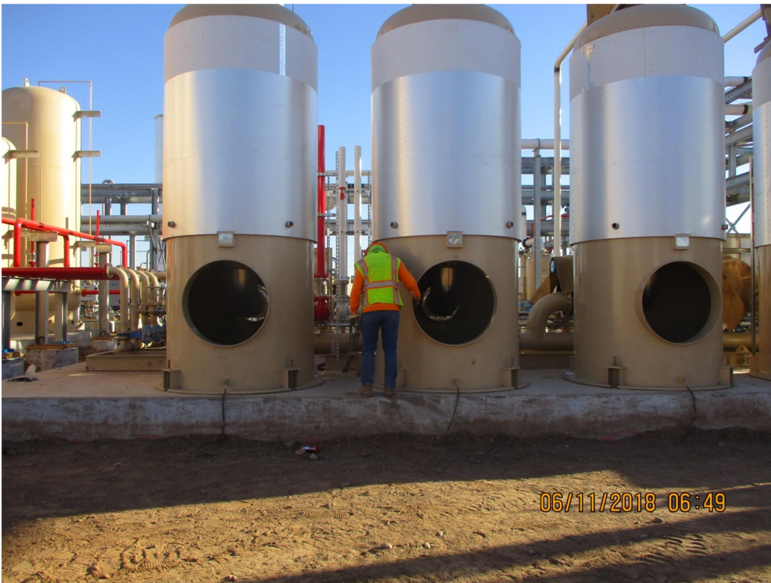
TSA Media Tanks