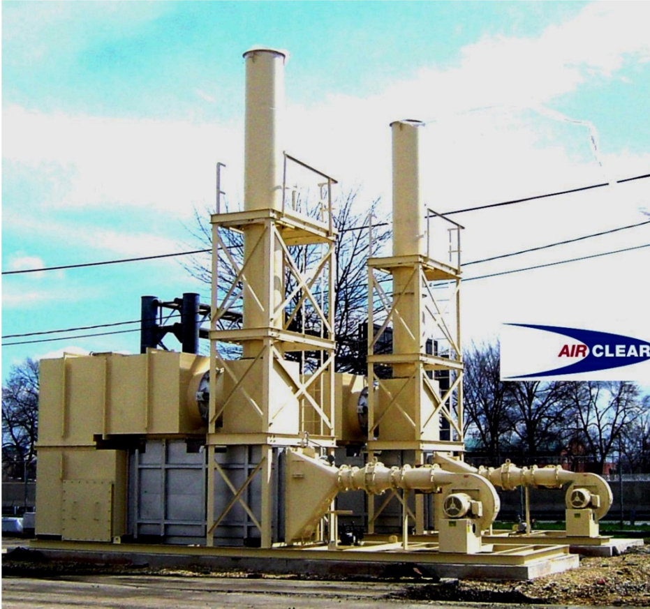
Recuperative Thermal Oxidizer