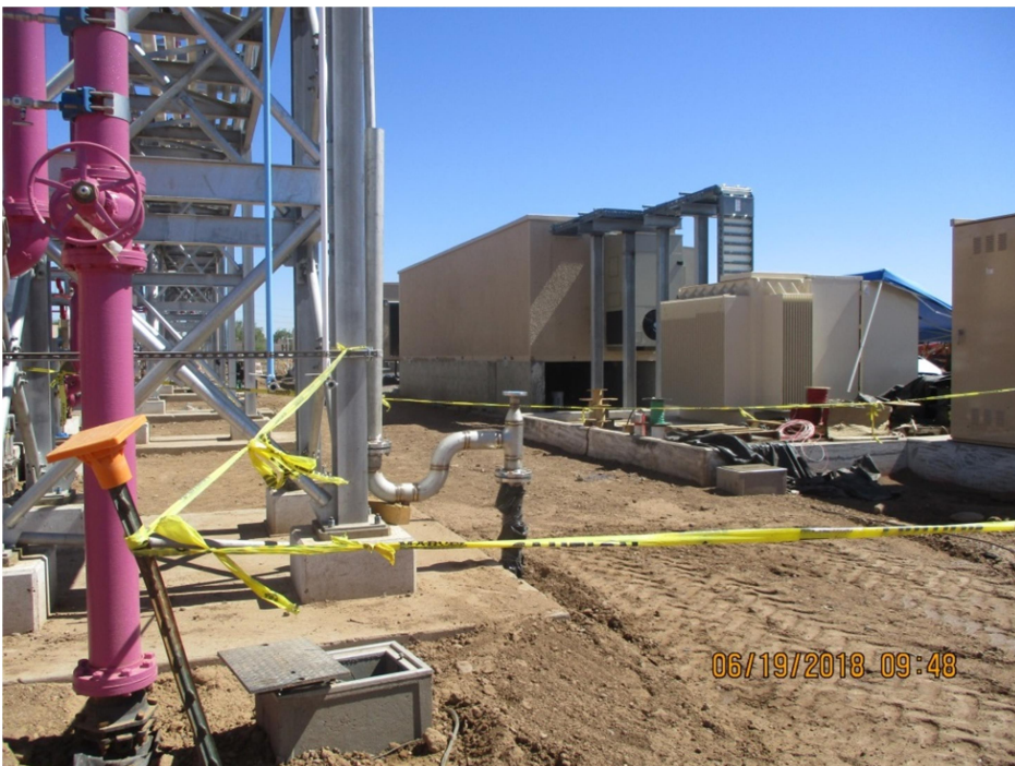
Overhead Pipe Assembly (left); Control Center on Skid (center)