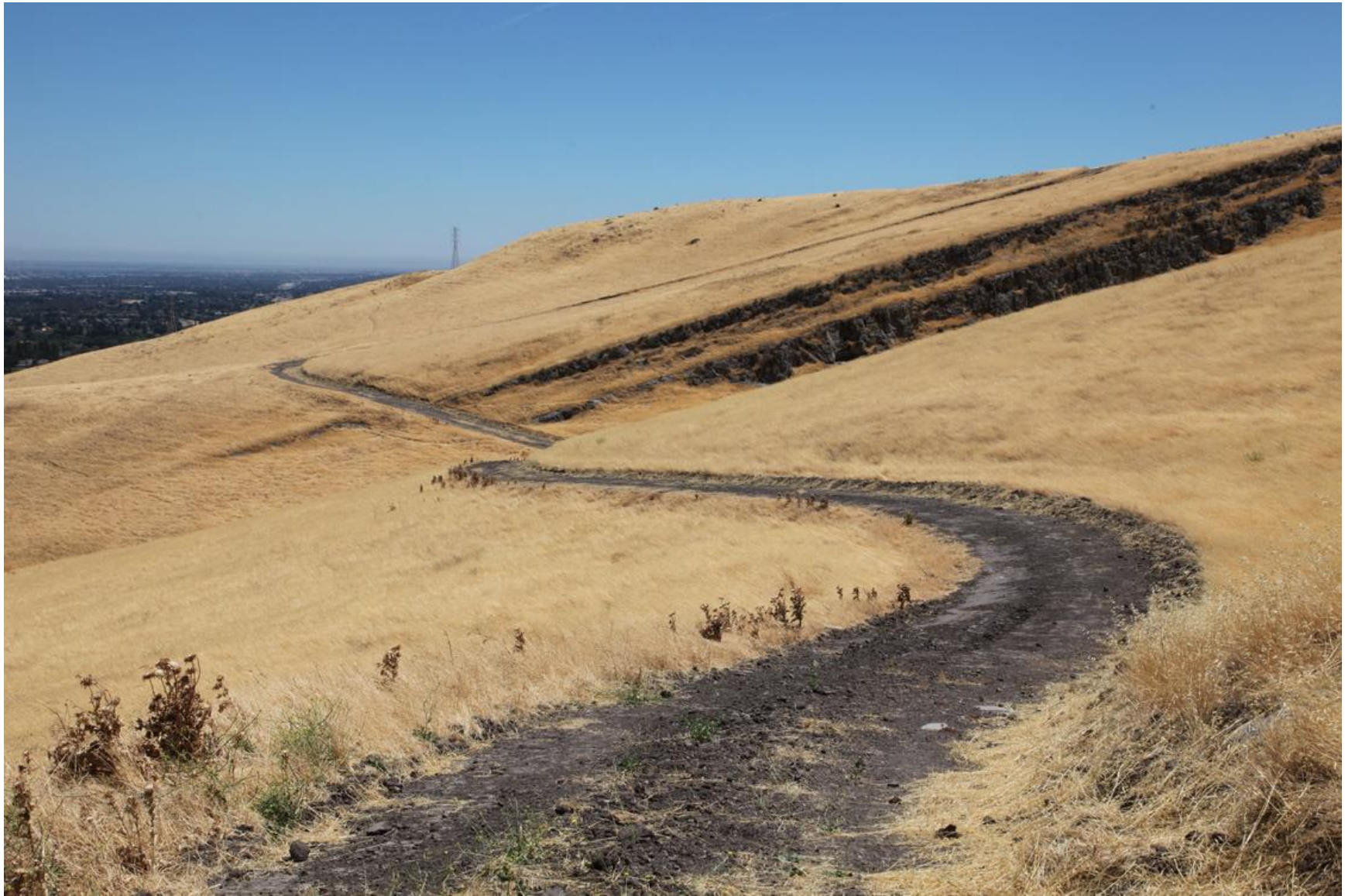
Pipeline Alignment To Be Constructed In Ranch Roads Were Possible