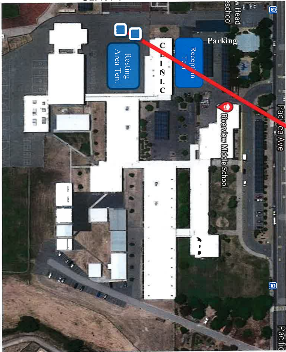
EXHIBIT A DEPICTION OF LICENSE AREA