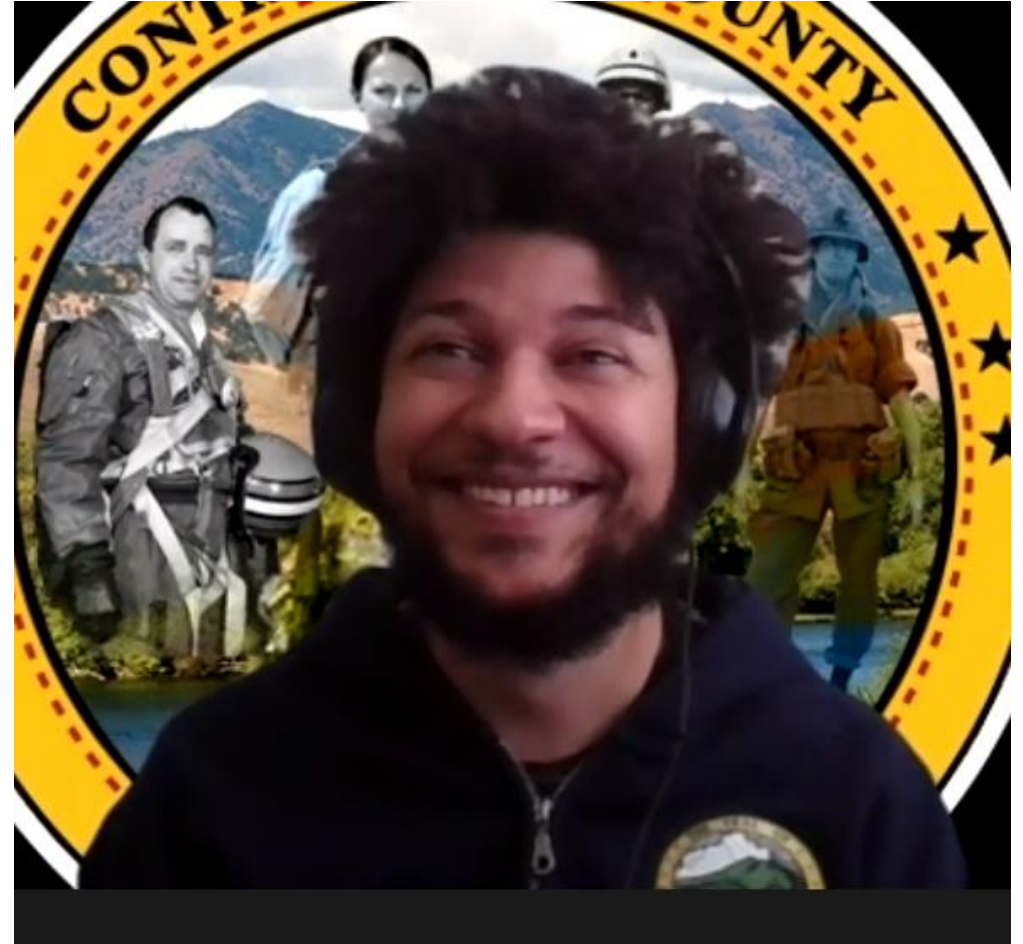
Warm greeting at the Veterans Services Online Office