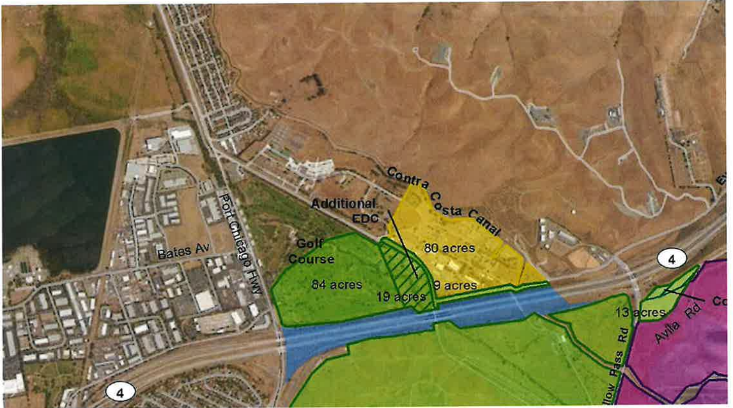
Exhibit "A" N4769221RP21P14