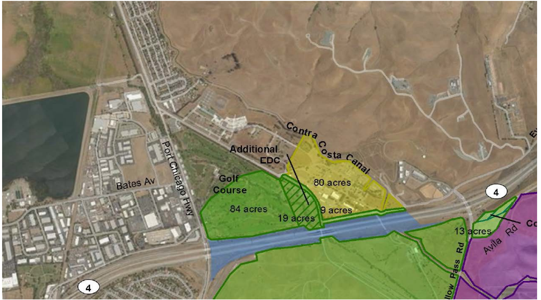
Exhibit A N4769220RP20P13