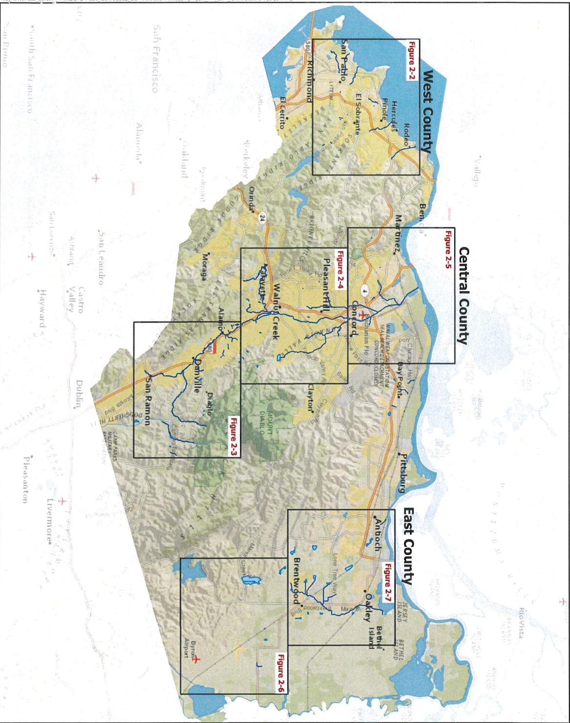
Figure 1 Contra Costa County Maintenance Areas Overview