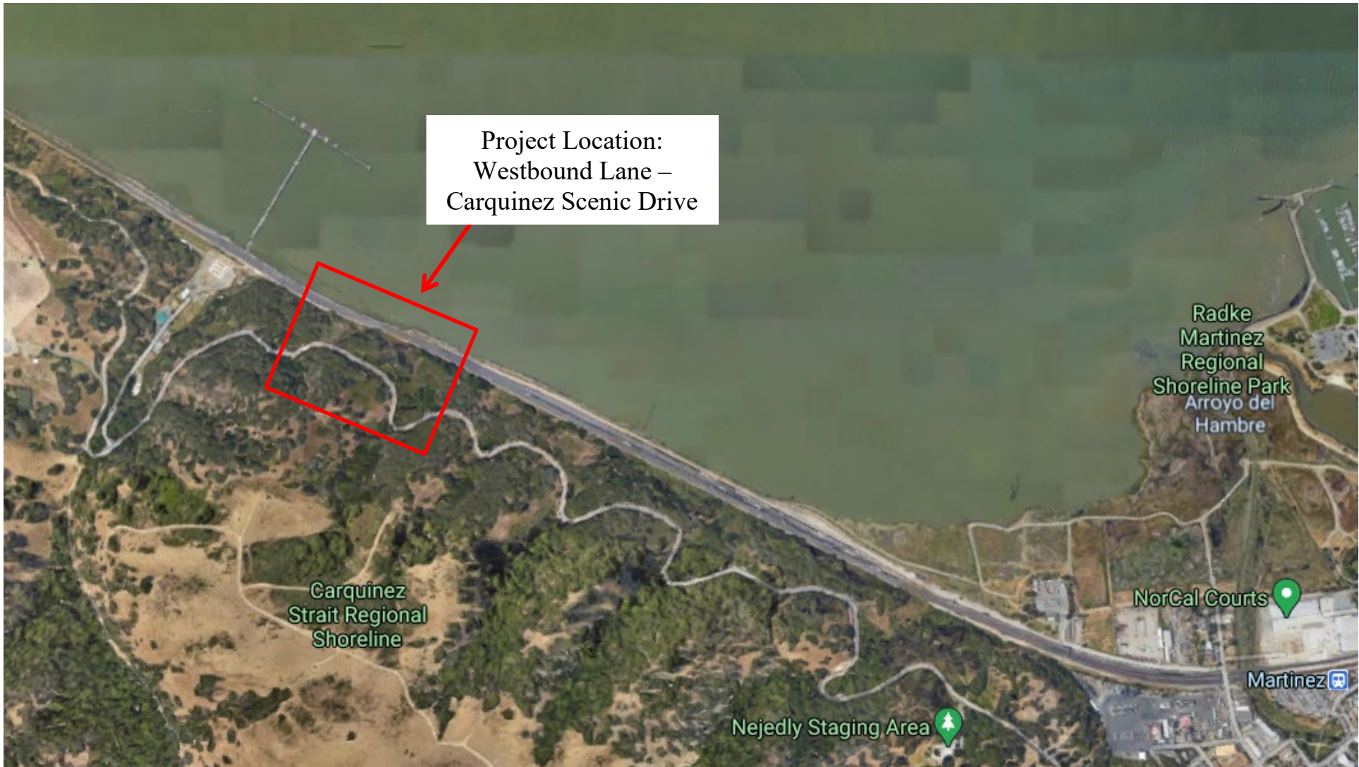
Carquinez Scenic Drive Embankment and Guardrail Repair FIGURE 2: Project Vicinity Map