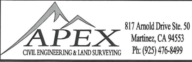
EXHIBIT 'B' PLAT TO ACCOMPANY LEGAL DESCRIPTION

DRAWN BY: BJL PROJECT NO: 16119 SCALE: 1"=100'