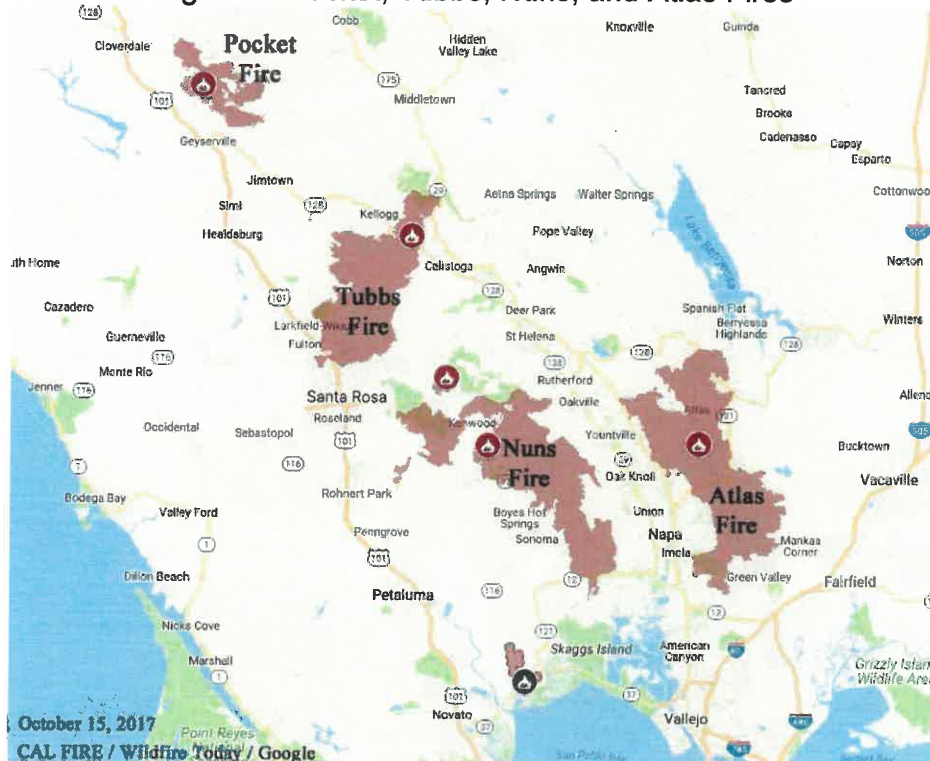
Figure 1: Pocket, Tubbs, Nuns, and Atlas Fires

The Santa Rosa (Tubbs) and Paradise (Camp) fires have increased Contra Costa County residents' awareness of the fire potential in their neighborhoods.