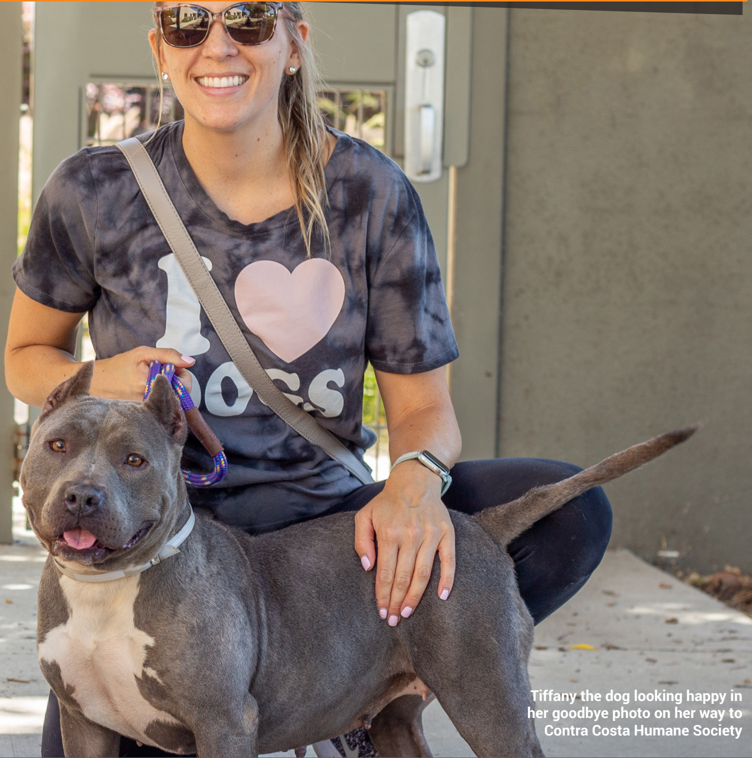
Tiffany the dog looking happy in her goodbye photo on her way to Contra Costa Humane Society

The CCAS Bridge Program served as a mechanism to assist our transfer partners in adopting more animals, particularly those with medical issues. In FY18/19, over $11,000 in Bridge Program funds were utilized in assisting transfer partners in adopting special needs animals from the Martinez and Pinole shelters. In December of 2018, with input from our Transfer Partners, CCAS made the strategic decision to discontinue the Bridge Program in FY18/19 and re-allocate the remaining funds to Medical Assistance (Panda's Gift Program). This decision streamlined the process to more effectively help our partners in alleviating the costs of medical and other services they incur as a result of pulling special needs animals from our shelters.