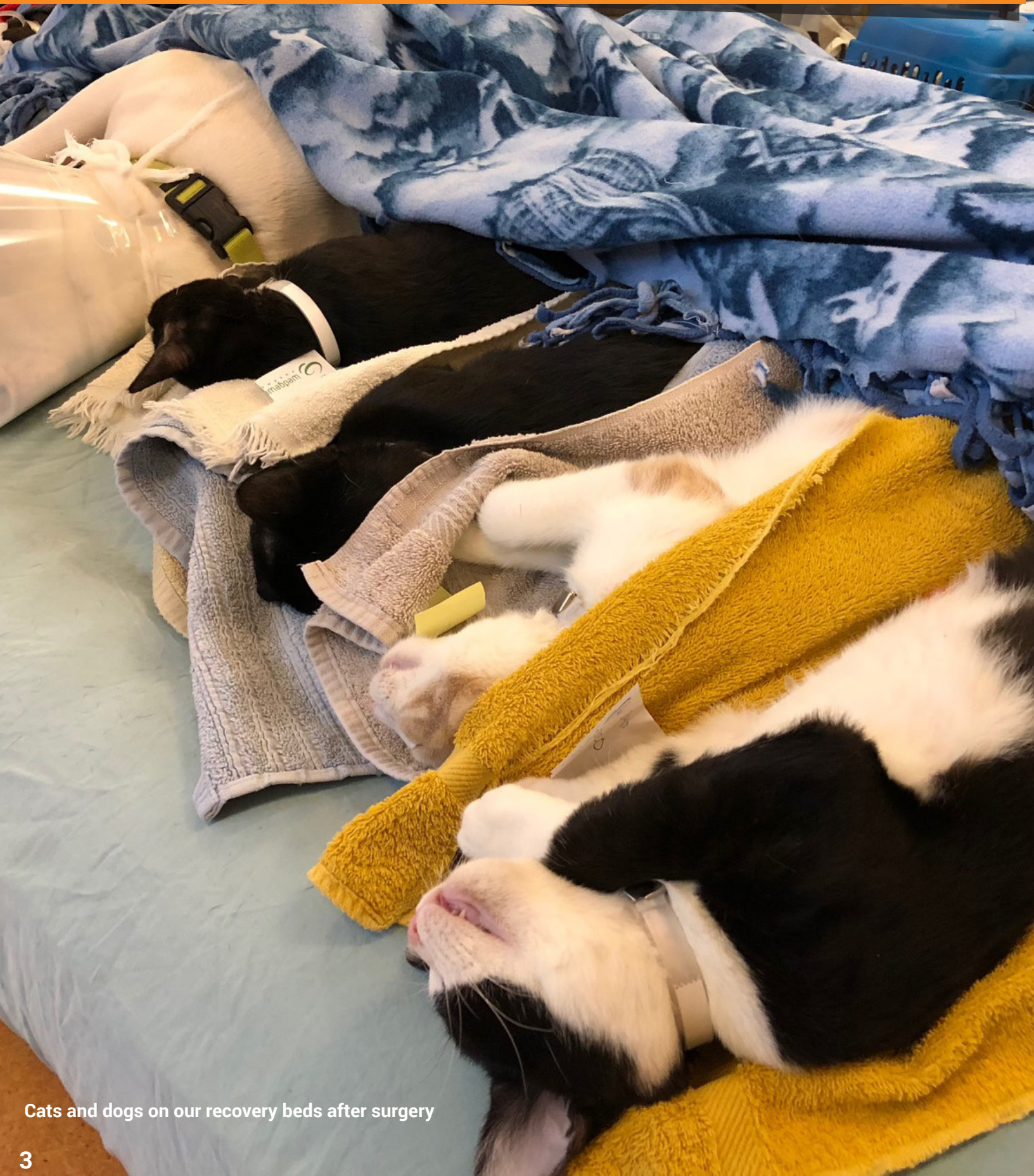
Cats and dogs on our recovery beds after surgery