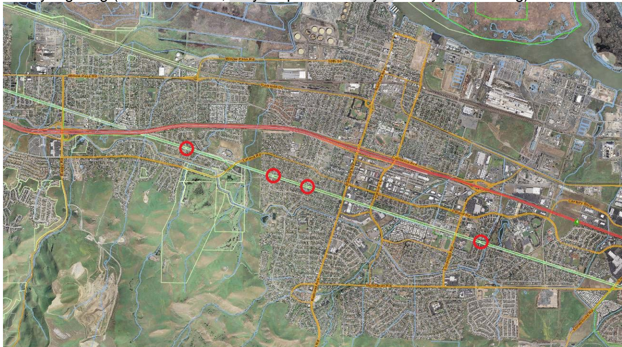
Safety Lighting (4 Intersections, may be performed by the City of Pittsburg)