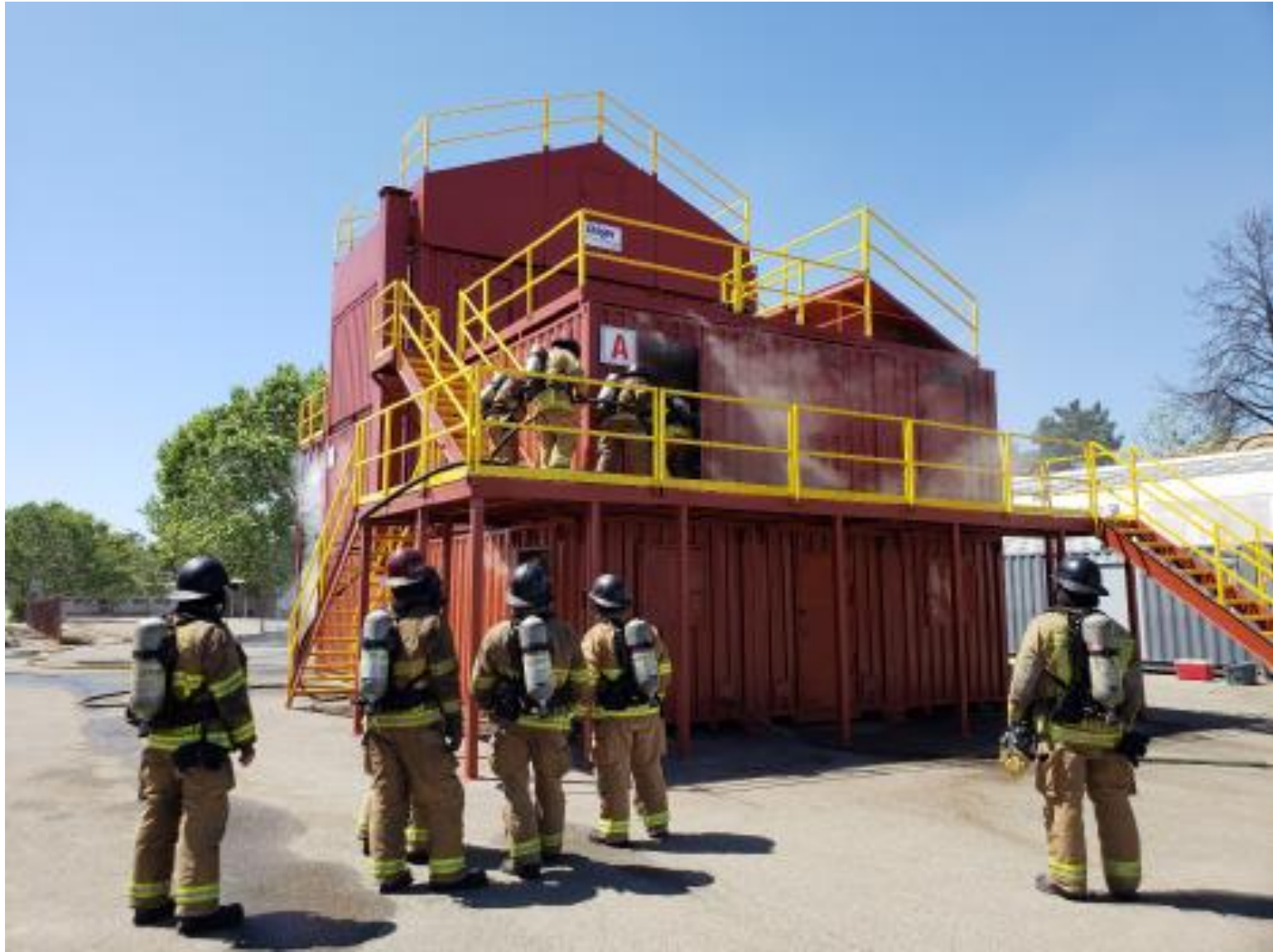
Exhibit D: Burn Simulator