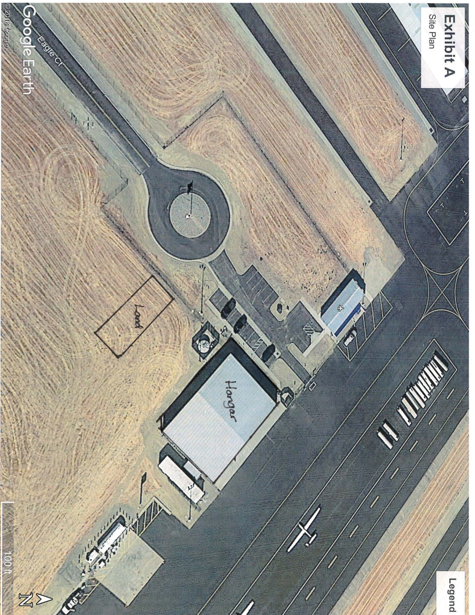
Exhibit A Site Plan