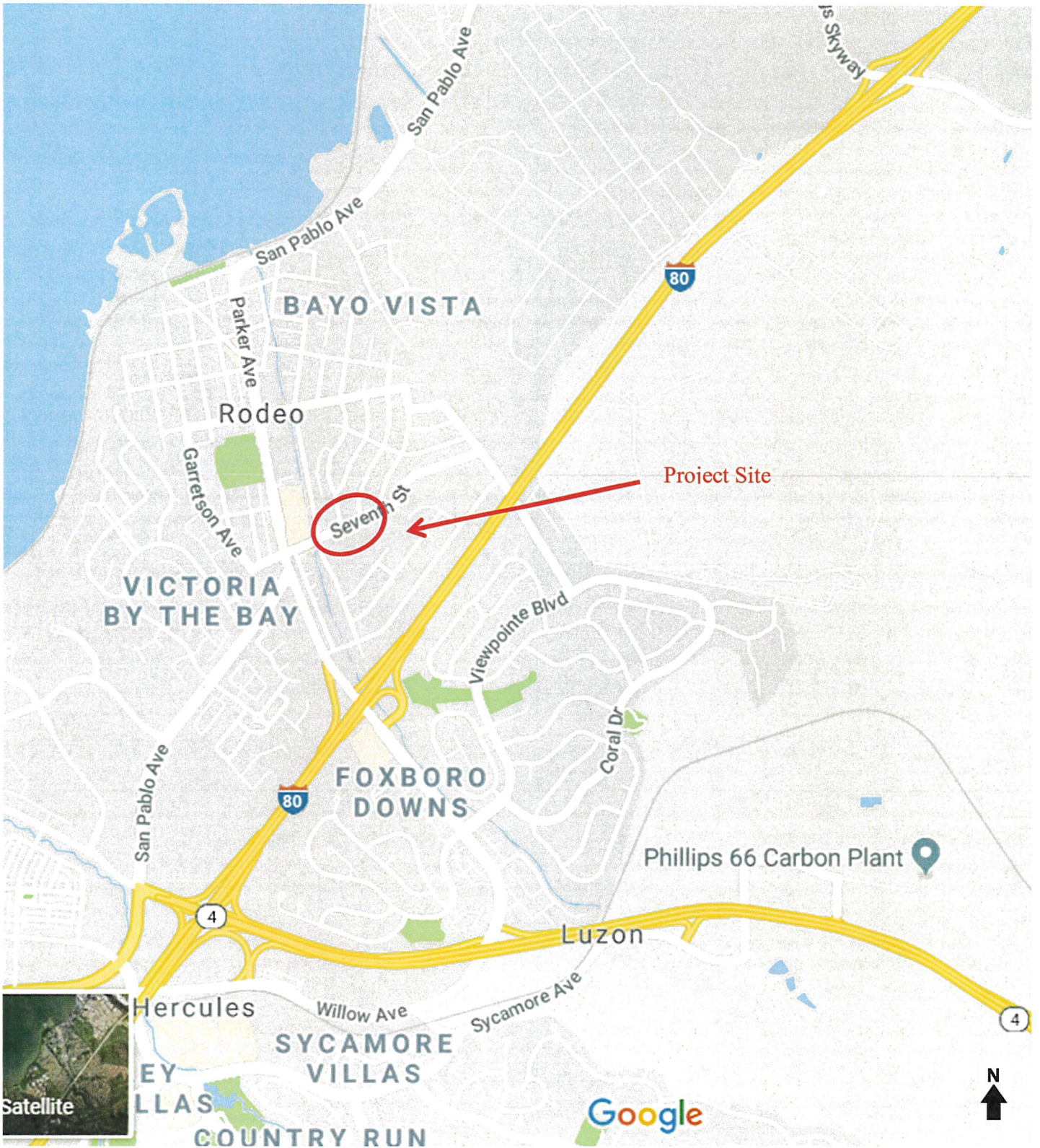
FIGURE 2: Project Vicinity Map