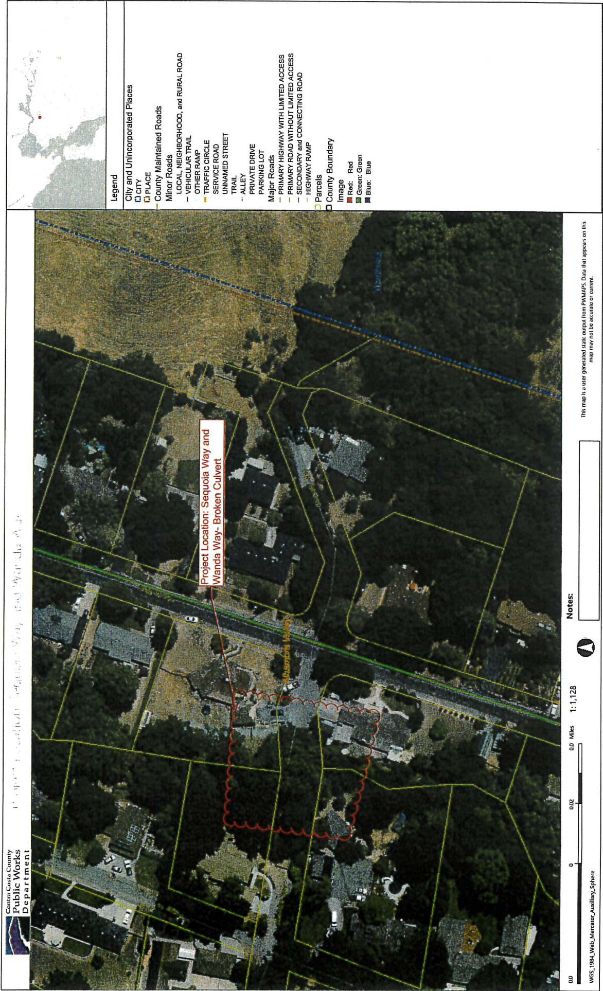
Figure 3: Project Location Map