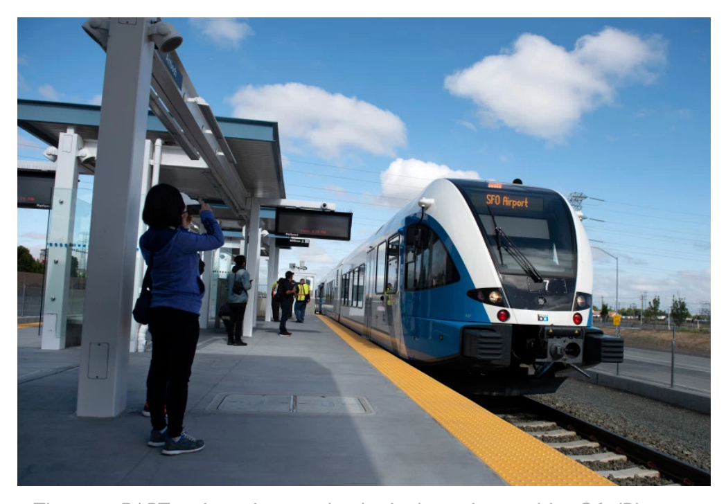
The new BART train arrives at the Antioch station on May 26.