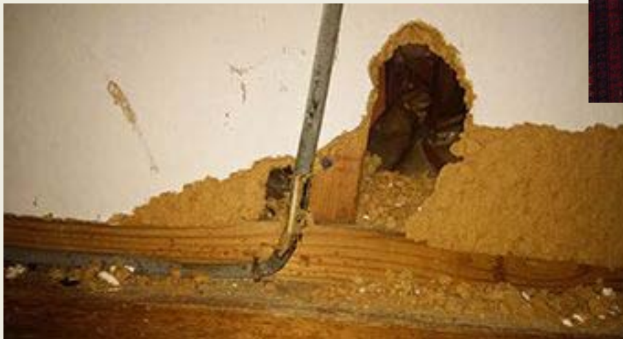
Rodents damage household belongings and structures