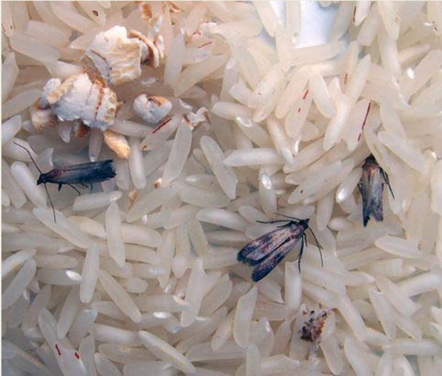
Grain moths contaminate food.