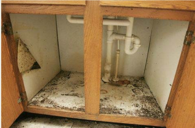
Cockroach droppings & scales