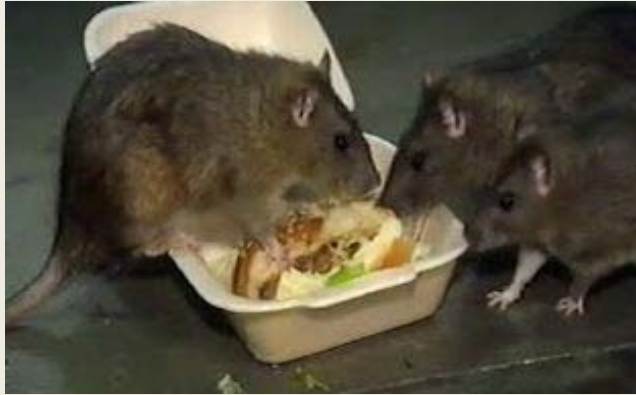
Rodents consume and contaminate human food.