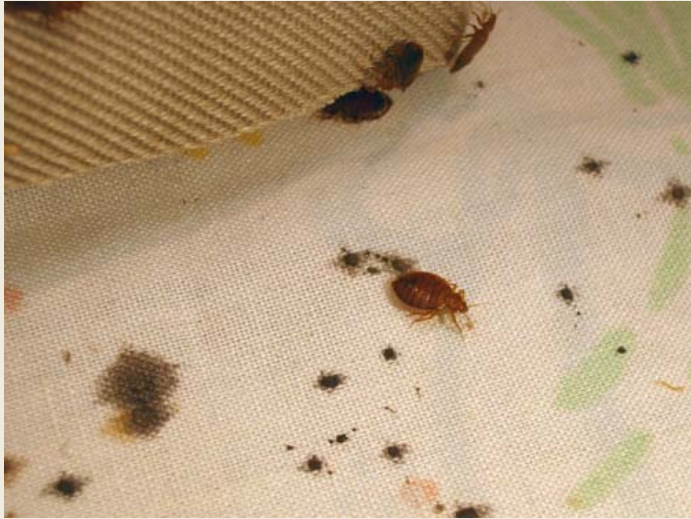
Stains on sheets, live bugs