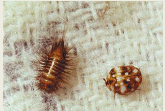
Carpet beetles and clothes moths ruin clothing and other belongings.