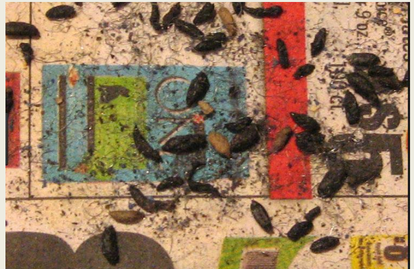
Rodent droppings, urine & hair