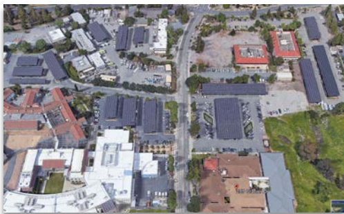
Figure 2: Contra Costa County has established itself as a leader in DER, as illustrated by this Google image showing a high penetration of parking lot canopy PV systems and EV chargers at a County complex that provides vital services to the public.

Public Works seeks input, direction and approval from the Board to modify or expand the DER plan as needed and to proceed with the implementation strategies.