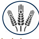
Agriscience/ Food Processing