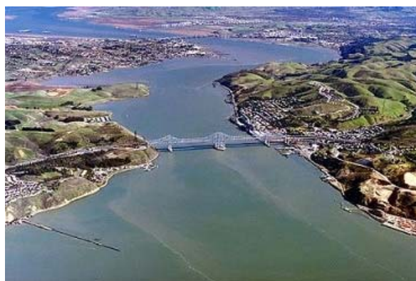
Northern Waterfront Ad Hoc Committee October 2, 2018