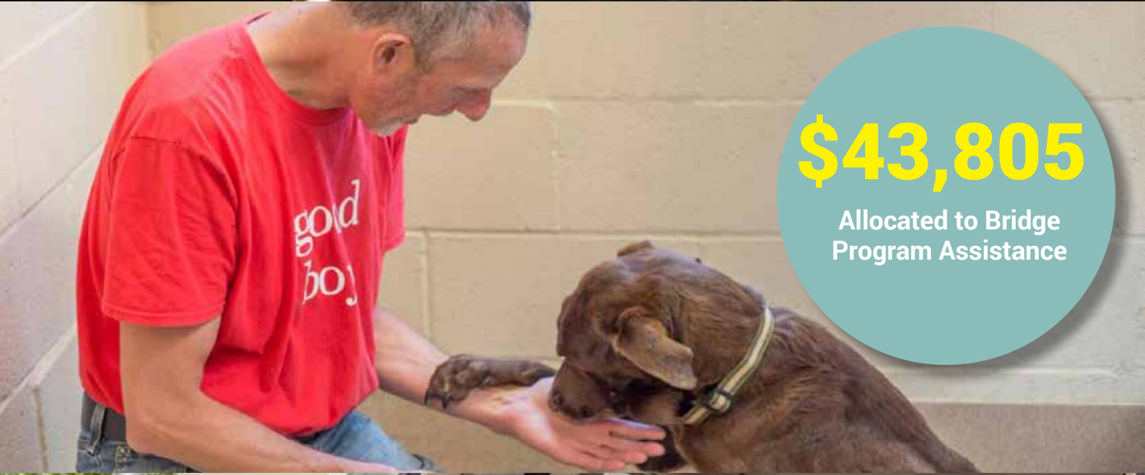
A huge community effort resulted in 12 dogs heading off to Idaho to start their new lives

$43,805 Allocated to Bridge Program Assistance