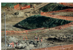
Editorial: SF deserves answers about falsified cleanup at Hunters

SF shipyard activists frustrated by naval officials on alleged