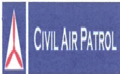
CAP_Email_Header_92ED59E379CF1.jpg 7 KB