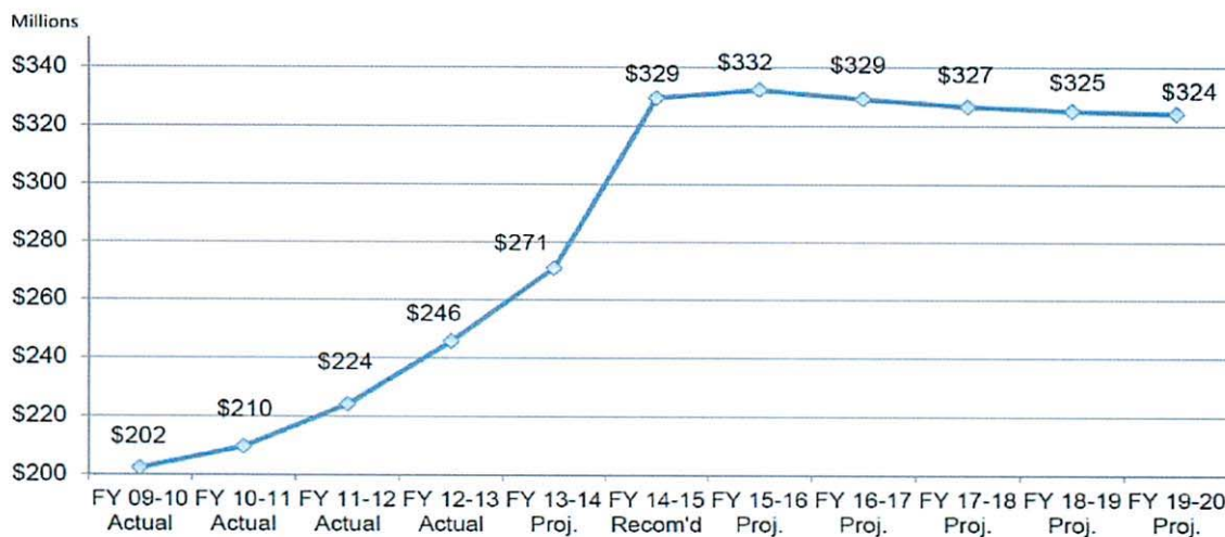
Actual and Projected* Retirement Expenses

These large increases in the County budget for retirement costs have been a major factor in County decisions to cut spending for health services, public safety (both sheriff and fire), and public works. The County has also had to defer important building maintenance and upgrade projects, including the construction and staffing of an emergency operations center. All of these projects and services have been "crowded out" in large part because of the County's obligation to keep its pension and other retirement obligations properly funded.