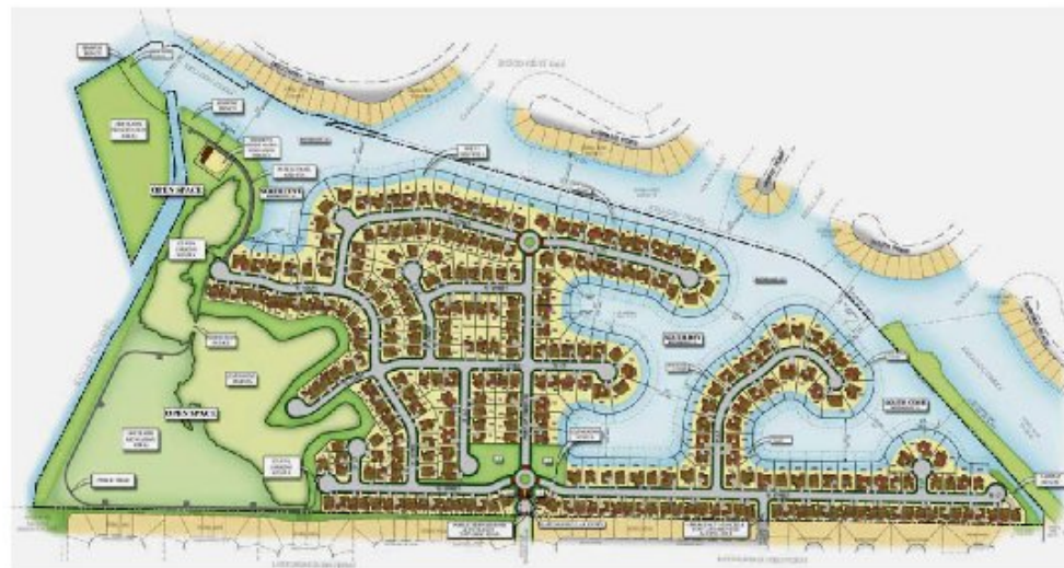
Proposed Modification to the plan September 2014