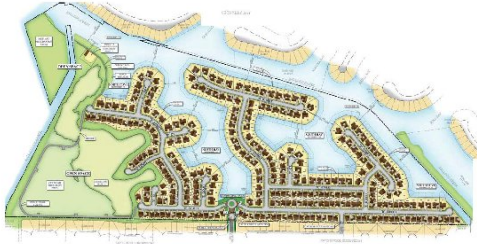
Previously approved plan by the Board of Supervisors December 2013