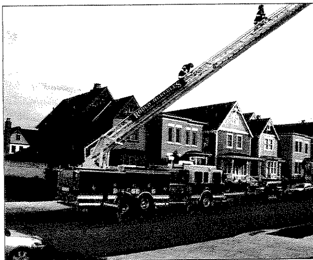
Rodeo Hercules Fire District firefighters use modern life-saving equipment that would be provided for with this measure