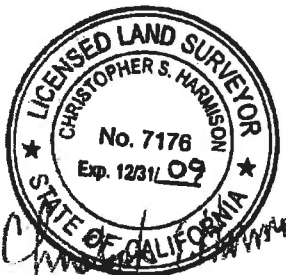
EXHIBIT 'B' ADAMS LANE - NORTH CONTRA COSTA COUNTY FLOOD CONTROL DISTRICT BRENTWOOD, CALIFORNIA JUNE 2008 CCCFC&WCD DRAWING NO. FA-20,007